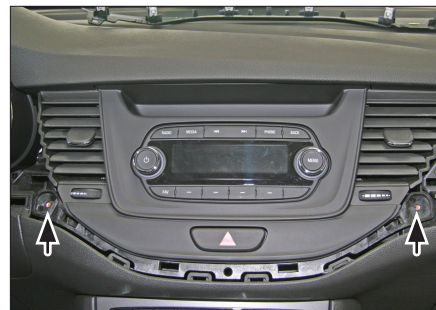
5. Remove screws (see arrows)