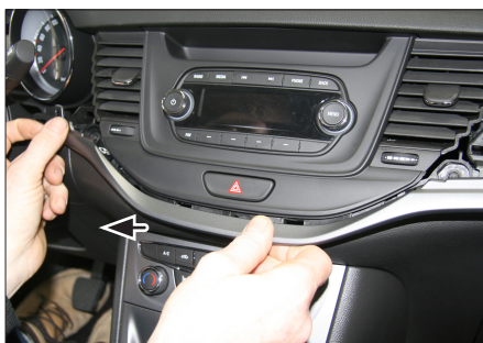
4. Remove trim frame (see arrows)