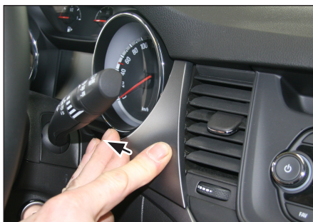
3. Remove panel cover between steering wheel and air vent (see arrows)