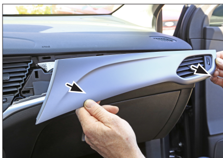
2. Remove front panel at the right side (see arrows)