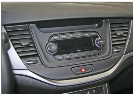
1. Opel Astra OEM Dashboard