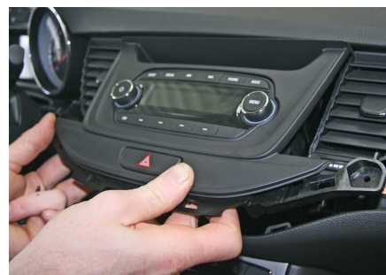
6. Remove head unit (unplug all cables carefully before)